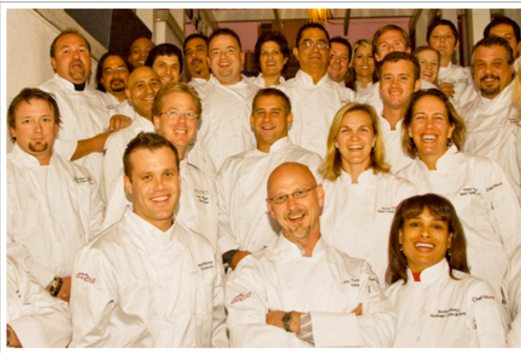
San Diego Bay Wine and Food Festival, San Diego, Calif.

Back to Story | « previous | slower | stop | faster | next »